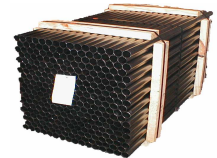
Wood Collared 2 x 2

These are standard specifications. We can modify to fit your needs.